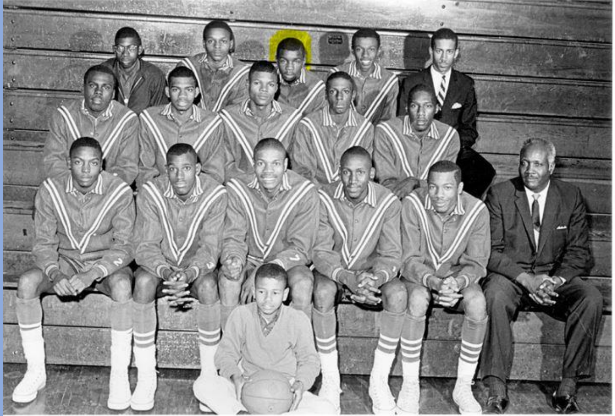
1966 Pony Express